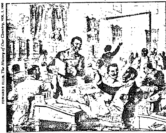
EDUARDO ELLER, The History of Our Country , Vol. 3, 1900

Reconstruction governments were portrayed as disastrous failures (left) because elected blacks were ignorant or corrupt. In fact, postwar corruption cannot be blamed on former slaves.